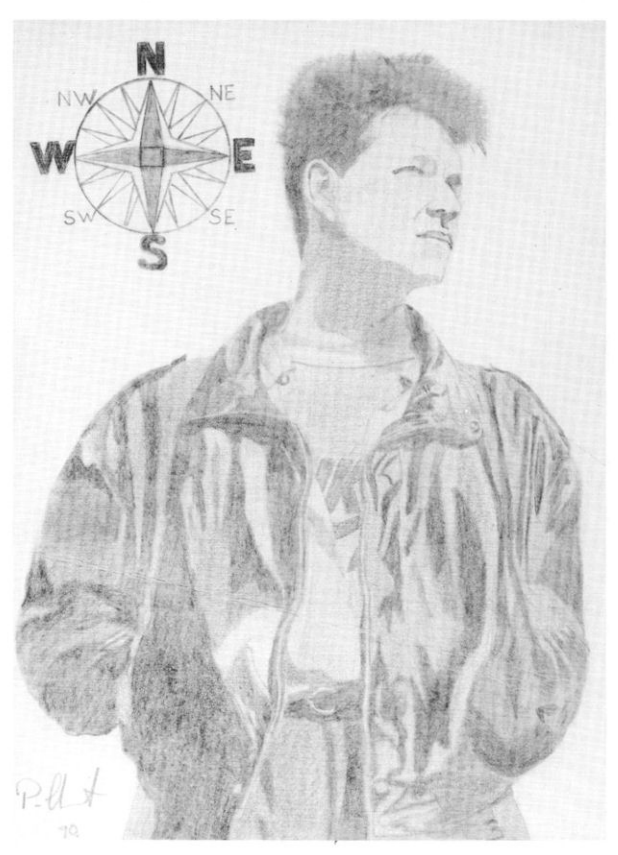
We want to reproduce more of your own photos, drawings, cortoons etc. so keep them coming.