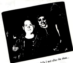
here's me with some fella I met after the show...

It's so Big Country's credit that its spirited (so pun intended) Halloween show was more than a long wait for its signature tune, "In a Big Country." Politicized rave-ups such