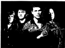
Big Country, where will you, that first time camera captures?

run away with me again time for us to grow run away with me again all of us alone